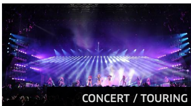
CONCERT / TOURING